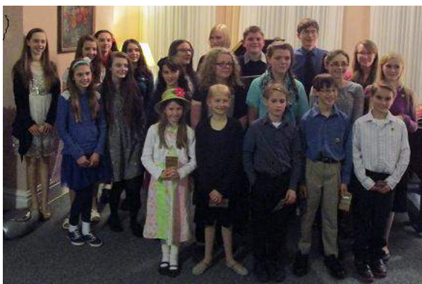
Junior Schubert Club members